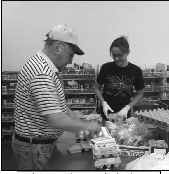
Volunteers package eggs for distribution.

livered to Holy Nativity Church. They add to it